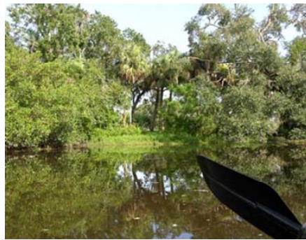
View from a kayak on Billy Creek Local residents are working to cleanup the urban creek and add creek side amenities in conjunction with Shady Oaks Park in Ft Myers.

The group got off to a quick start with many meetings to attend, as the funding for water quality projects and state appropriations was in full-swing. This creek was prioritized as the number one project for the Caloosahatchee Partners for Restora-