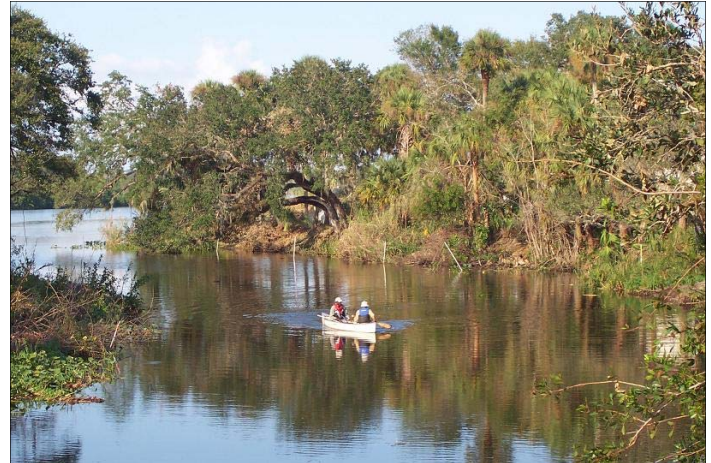
Canoeists enjoy the newly-restored Ft Denaud Oxbow, Hendry

We have much to do. Stormwater utilities are lacking, educational programs such as Florida Yards and Neighborhoods are under-funded, land use changes are approved a rapid pace without adequate diligence, and shortages of professional staff on all levels are apparent.