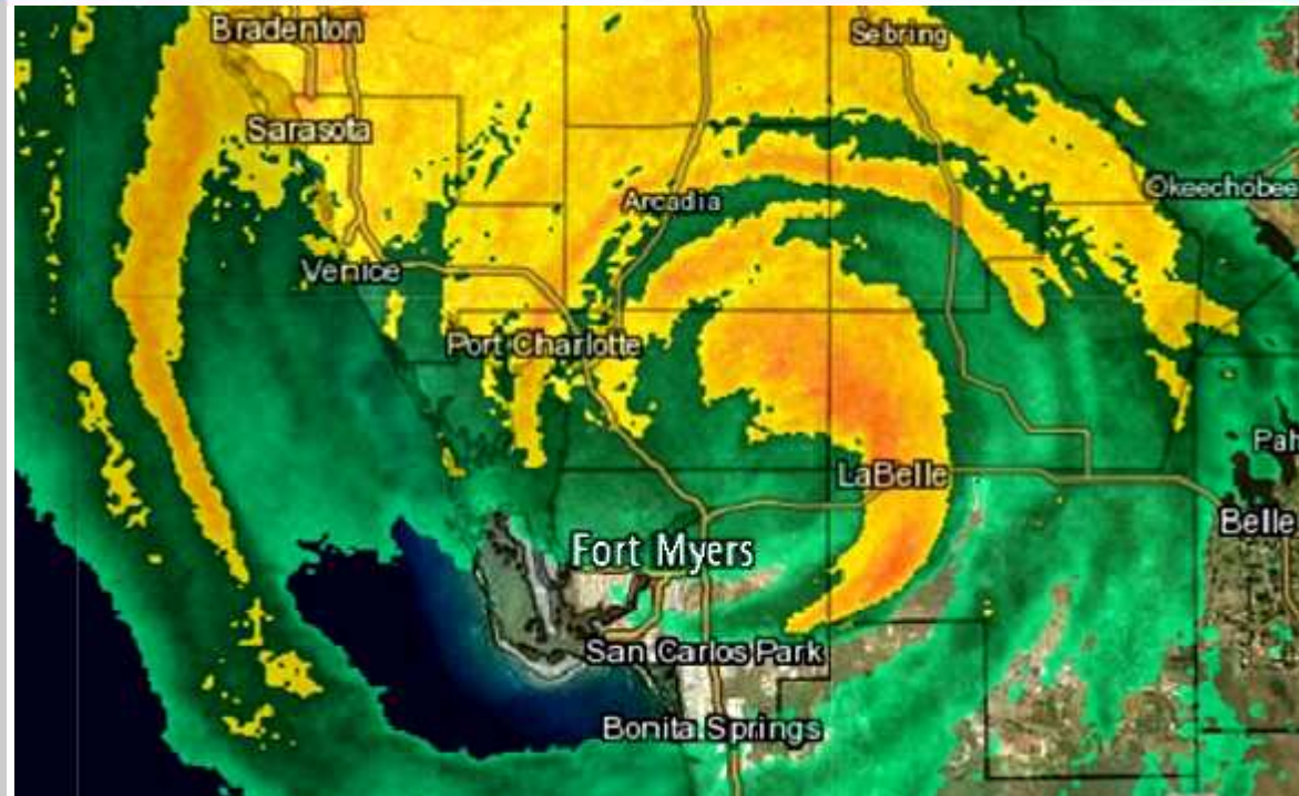
Hurricane Irma plowed through the Caloosahatchee region on Sep 10.

Editorial Disclaimer CalusaWaterkeeper.org Facebook