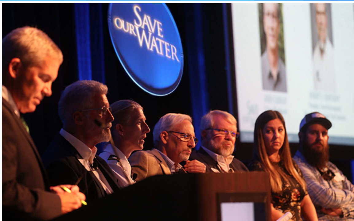
The Save Our Water Summit expert panel included Calusa Waterkeeper.

Editorial Disclaimer CalusaWaterkeeper.org Facebook