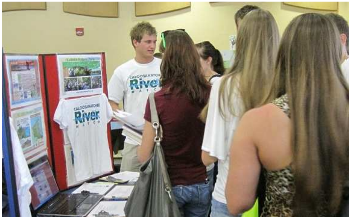
CRCA recruited student volunteers at the FGCU Service Learning Fair.

For more river news visit the CRCA web site at crca.caloosahatchee.org Also, you can renew your membership online