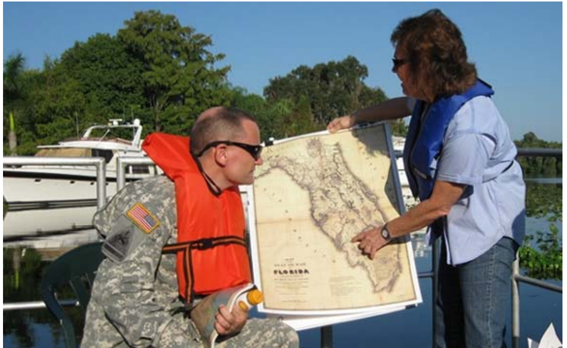
New Army Engineers Colonel Introduced to the Caloosahatchee

For more river news visit the CRCA web site at crca.caloosahatchee.org Also, you can renew your membership online