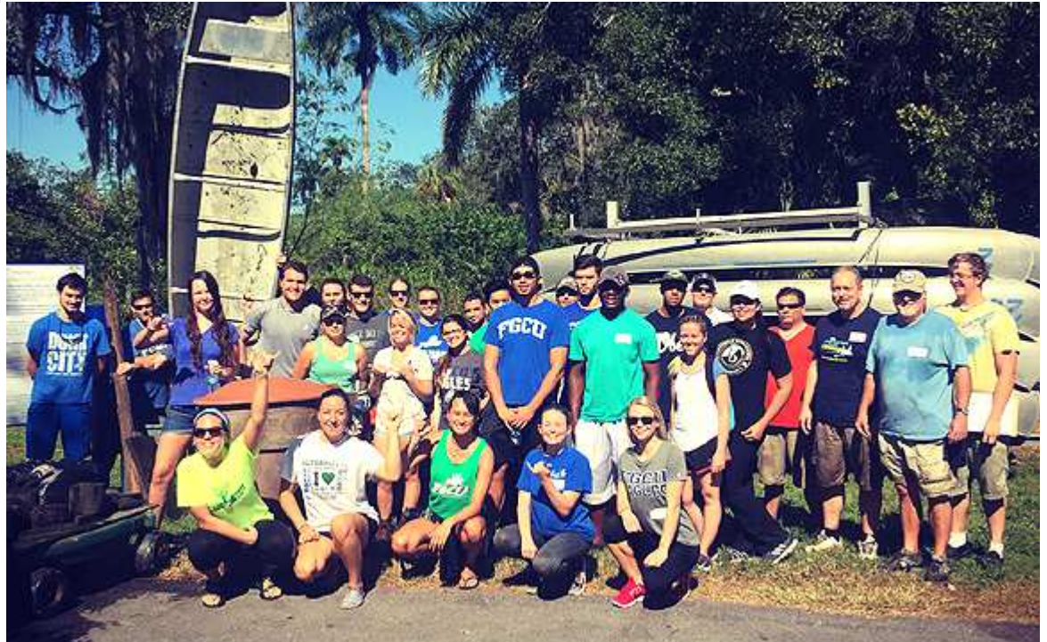
More than 60 joined in the CRCA Billy's Creek Clean-up.

Editorial Disclaimer Visit the CRCA web site crca.caloosahatchee.org Join us at Facebook