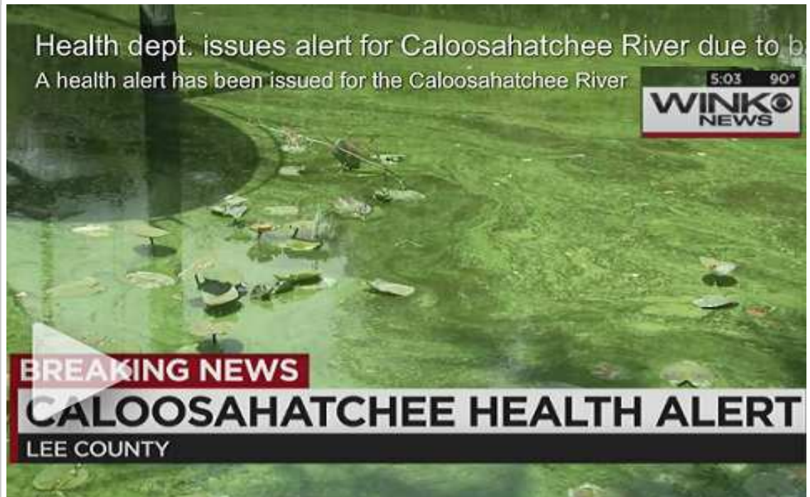
Algal blooms are now a regular feature of the river. How utterly sad!

Editorial Disclaimer Visit the CRCA web site crca.caloosahatchee.org Join us at Facebook