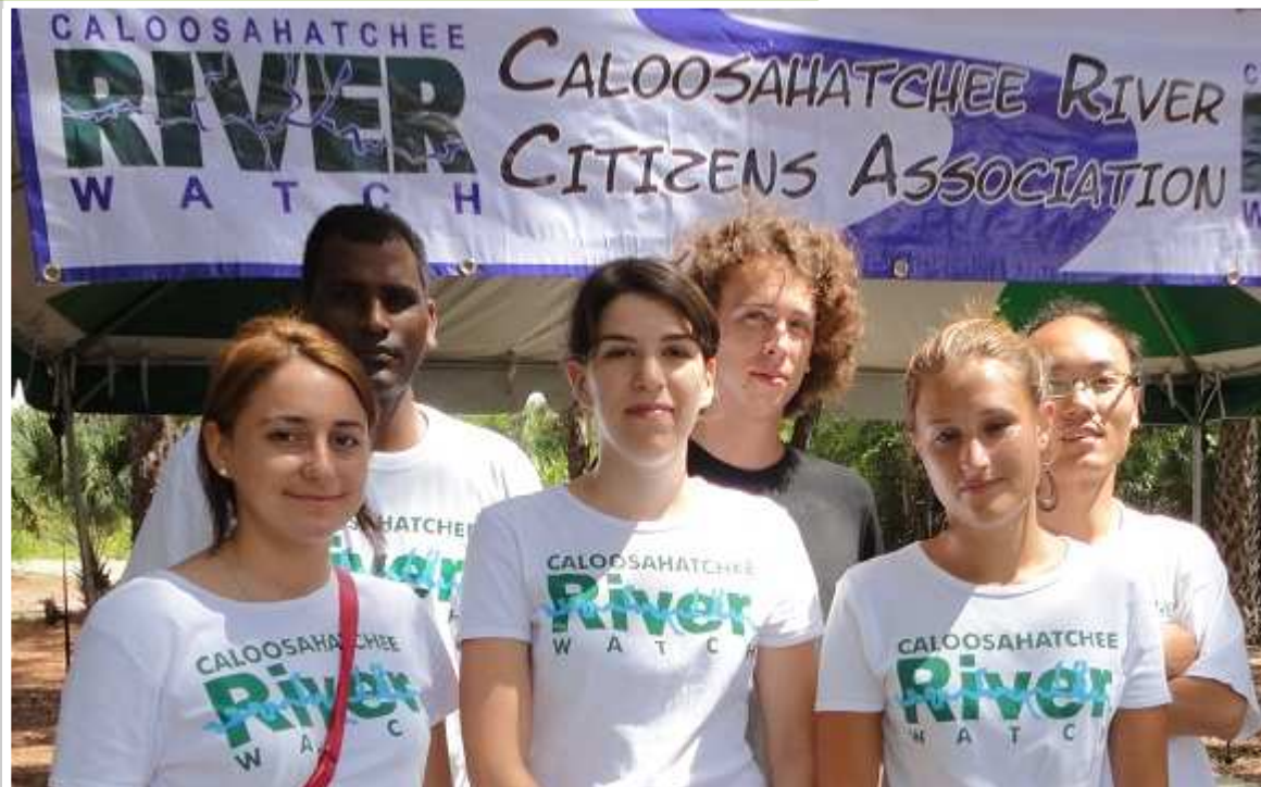
Riverwatch team teaches kids about water conservation on Earth Day.

For more river news visit the CRCA web site at crca.caloosahatchee.org Also, you can renew your membership online