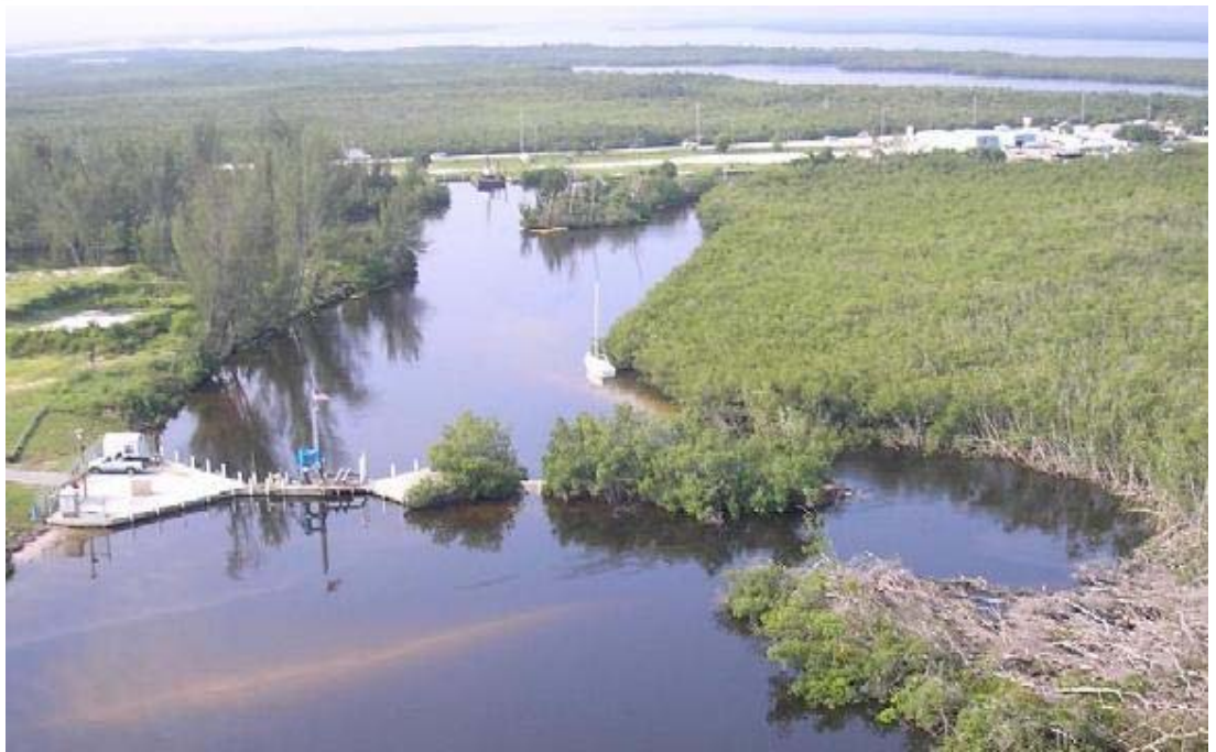
Ceitus Boat Lift in Cape Coral to be removed subject to legal settlement.

For more river news visit the CRCA web site at crca.caloosahatchee.org Also, you can renew your membership online