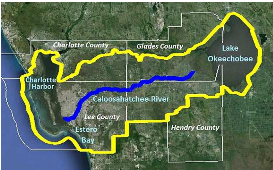
CRCA's new Waterkeeper Alliance Affiliate program coverage area.

Editorial Disclaimer Visit the CRCA web site crca.caloosahatchee.org Join us at Facebook