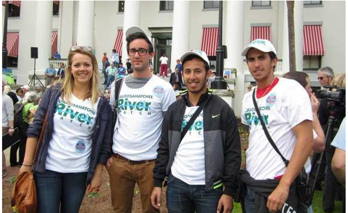
Riverwatch participated in the Tallahassee clean water rally.

Editorial Disclaimer Visit the CRCA web site cra.caloosahatchee.org Join us at Facebook