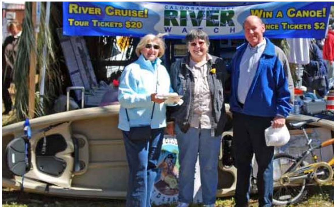
Riverwatch members gathered at LaBelle's Swamp Cabbage Festival

For more river news visit the CRCA web site at crca.caloosahatchee.org Also, you can renew your membership online