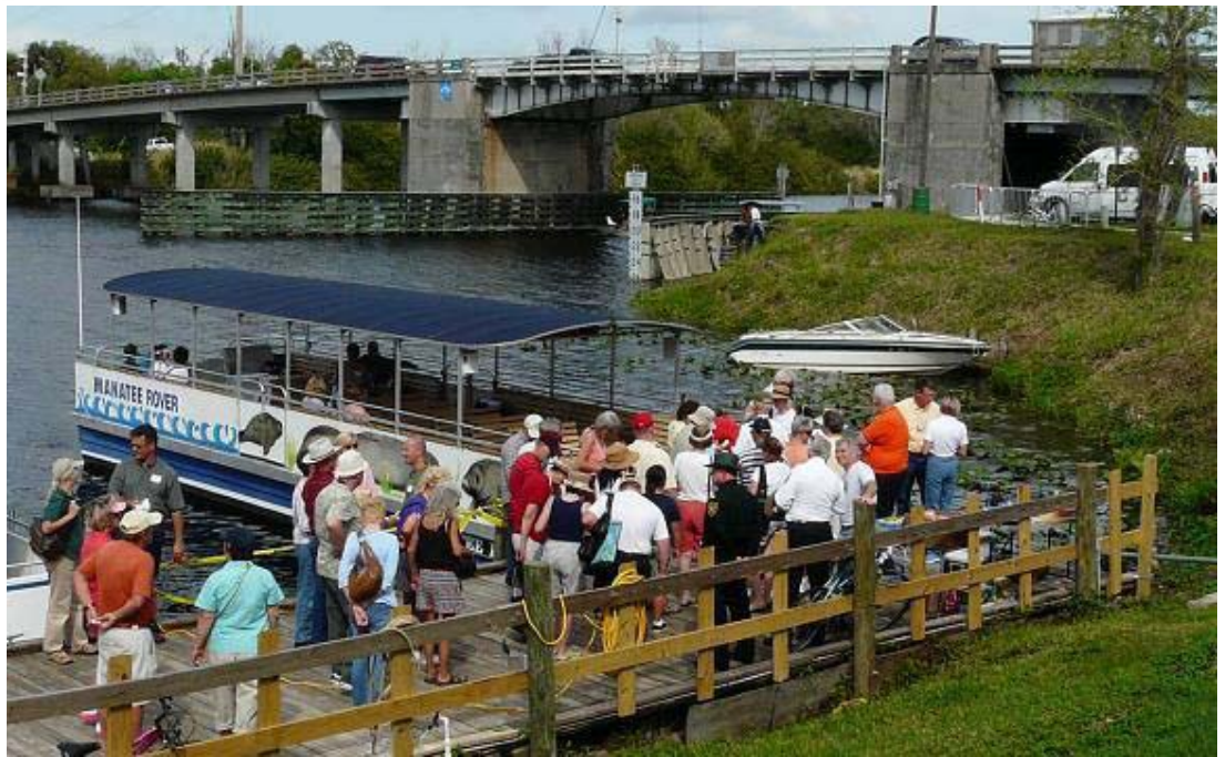
CRCA sponsored two river cruises for both policy talks and recreation.

For more river news visit the CRCA web site at cra.caloosahatchee.org Also, you can renew your membership online