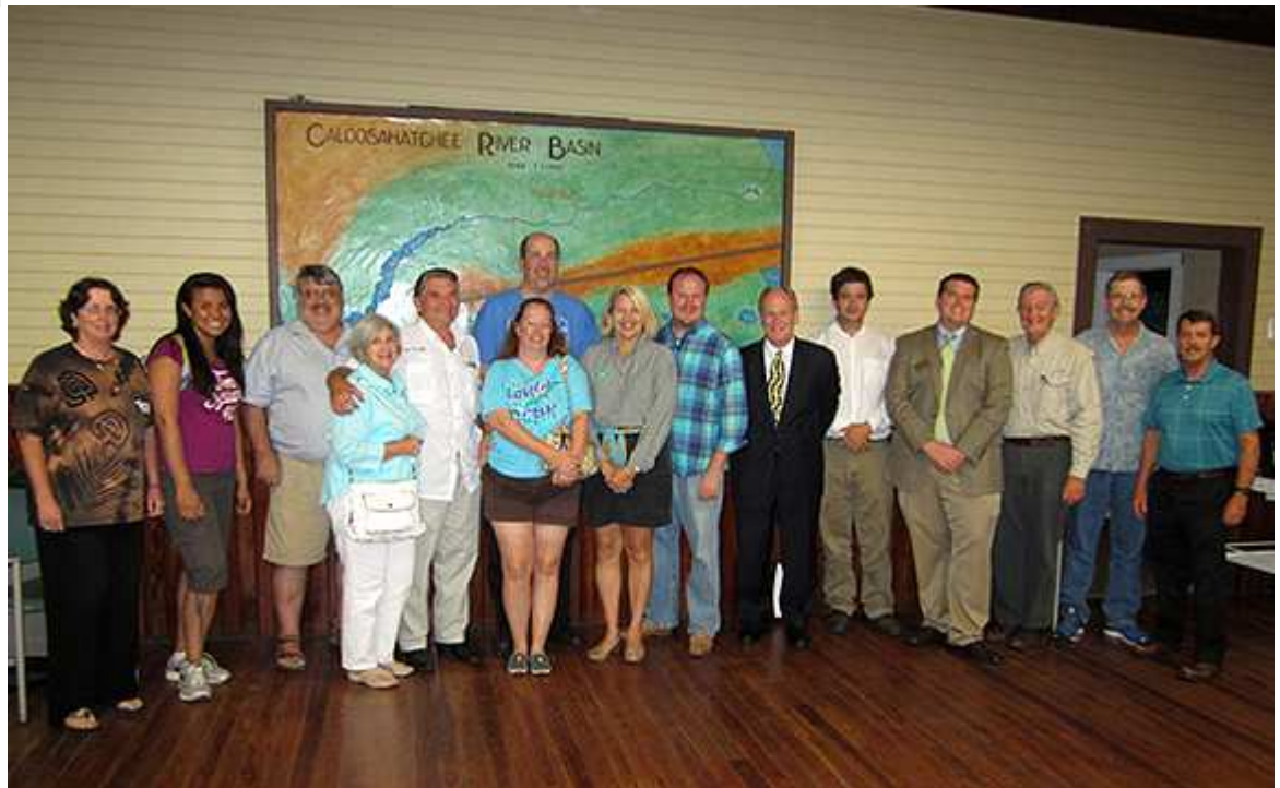
CRCA members & guests pictured at the June 4th meeting at CNC.

Editorial Disclaimer Visit the CRCA web site cra.caloosahatchee.org Join us at Facebook