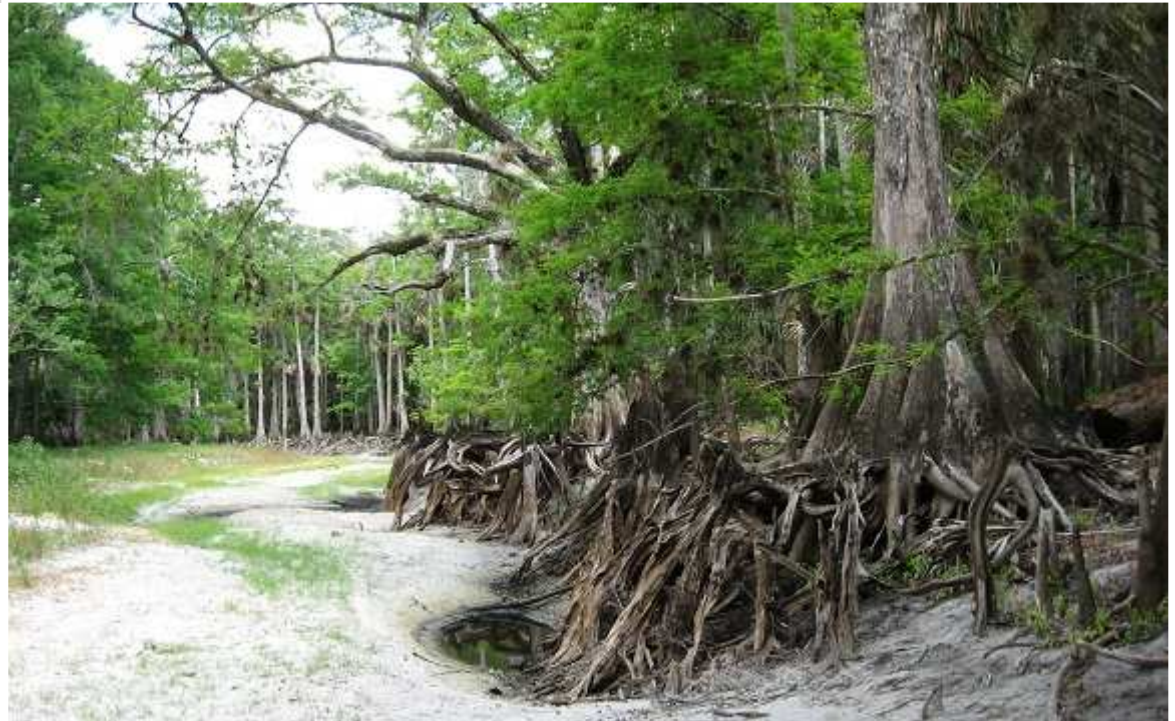
Fisheating Creek was bone dry for the CRCA picnic, but hiking was fun.

For more river news visit the CRCA web site at crca.caloosahatchee.org Also, you can renew your membership online