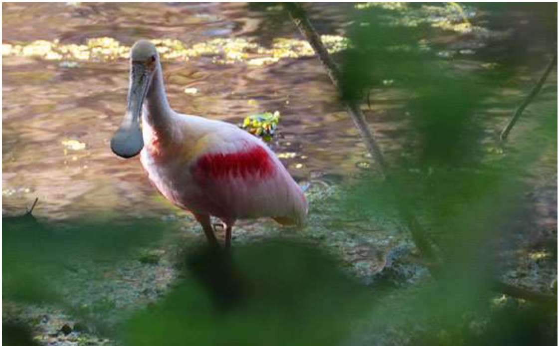
Caloosahatchee & Okeechobee region attracts birders for Big O Festival.

For more river news visit the CRCA web site at crca.caloosahatchee.org Also, you can renew your membership online