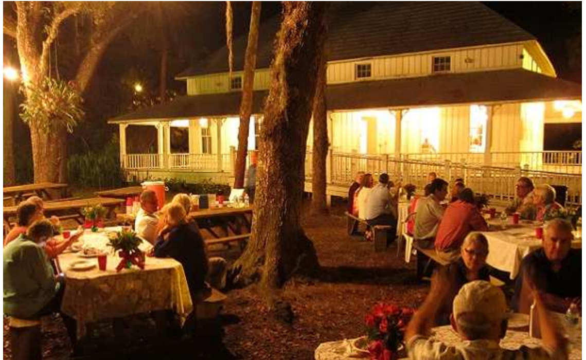
The CRCA holiday party was held at LaBelle's beautiful Hendry House.

Editorial Disclaimer Visit the CRCA web site crca.caloosahatchee.org Join us at Facebook