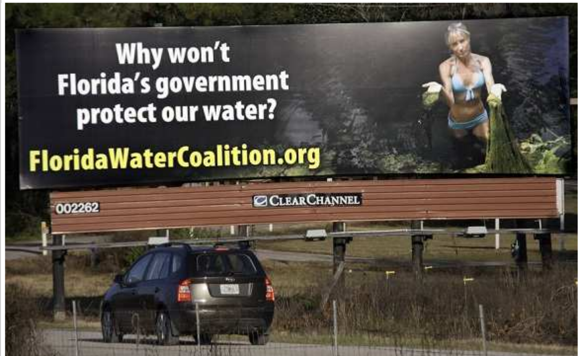
Slime billboards greet tourists returning to Florida this holiday season.

For more river news visit the CRCA web site at crca.caloosahatchee.org Also, you can renew your membership online