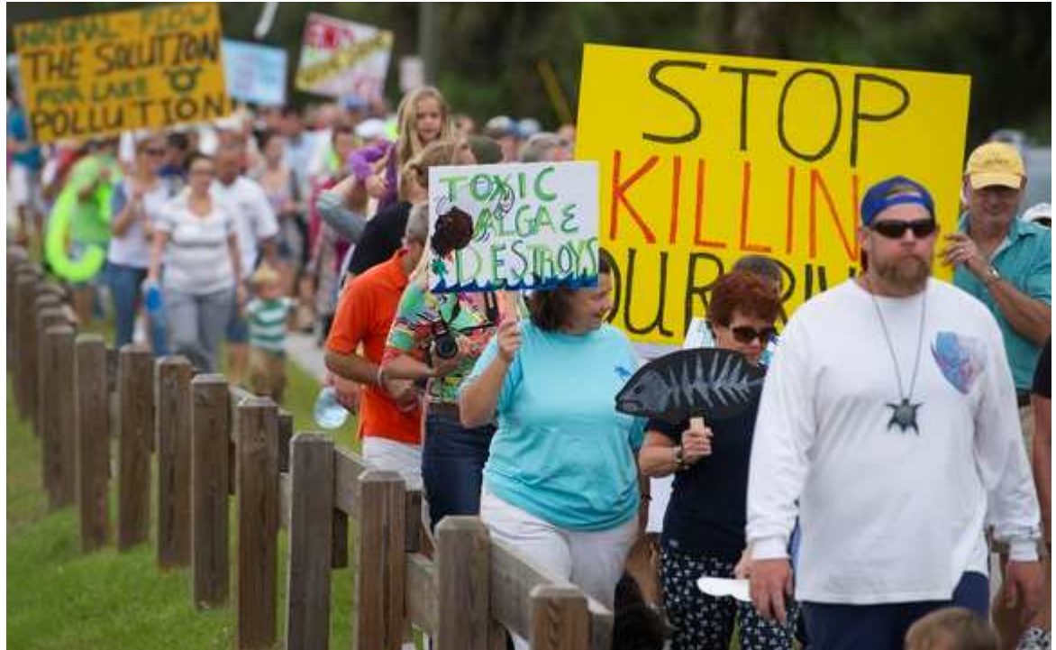
Citizens protest at the Second Annual River Rally in Stuart.

Editorial Disclaimer Visit the CRCA web site crca.caloosahatchee.org Join us at Facebook