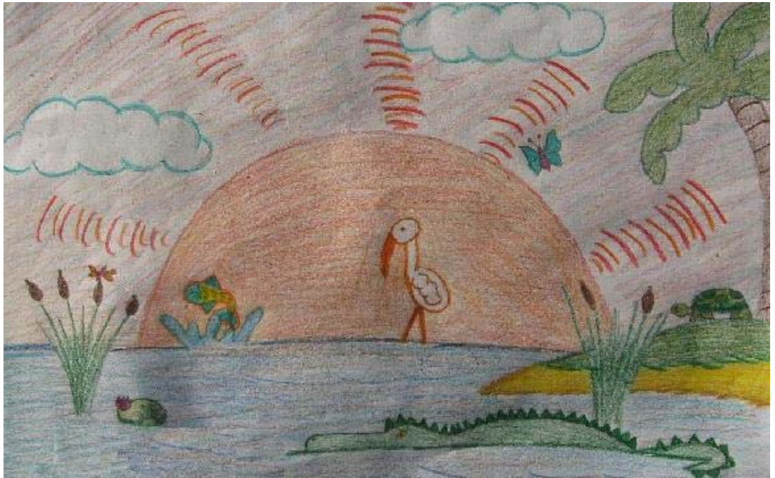
Local elementary school children celebrated Earth Day with art.

For more river news visit the CRCA web site at crca.caloosahatchee.org Also, you can renew your membership online