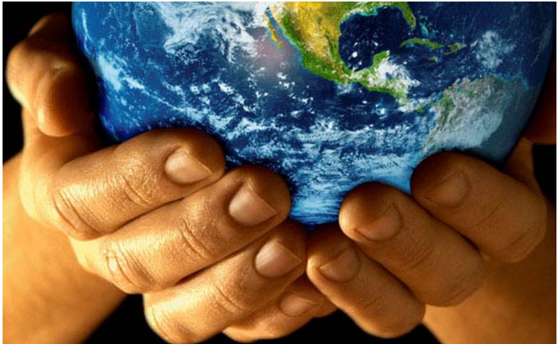
CRCA Earth Day Events in LaBelle on Apr 26 and Koreshan on Apr 19

For more river news visit the CRCA web site at crca.caloosahatchee.org Also, you can renew your membership online