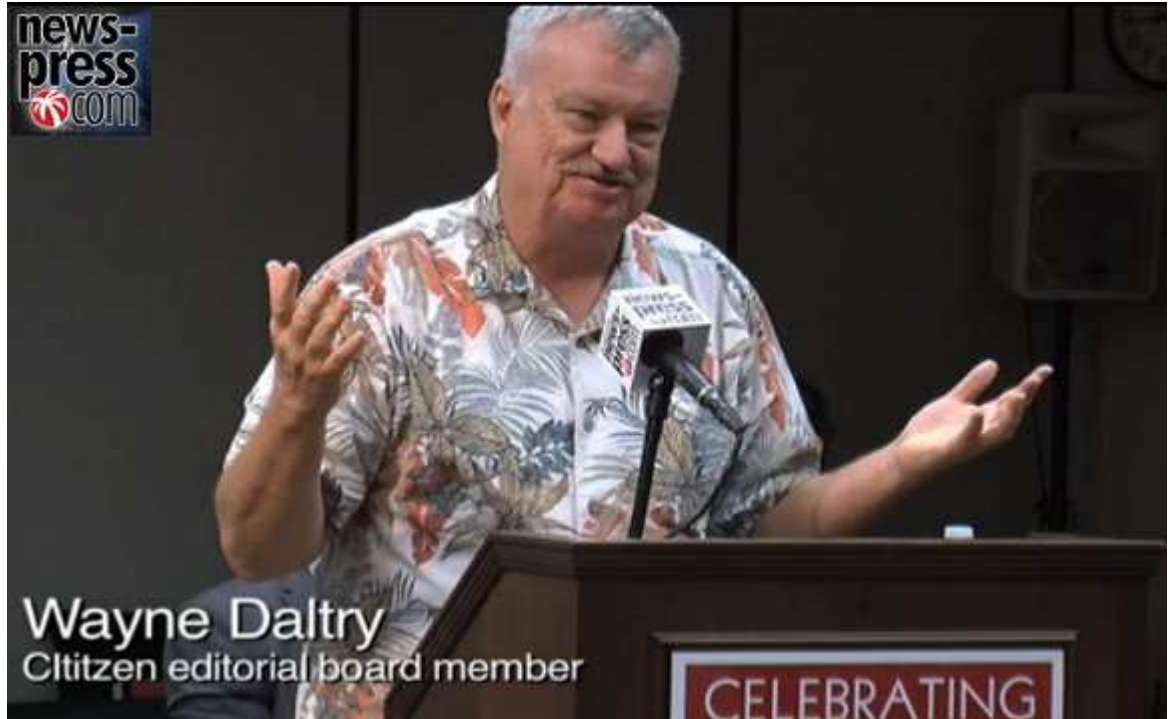
CRCA Pres. asks legislators about solution timeline for basin storage.

Editorial Disclaimer Visit the CRCA web site crca.caloosahatchee.org Join us at Facebook